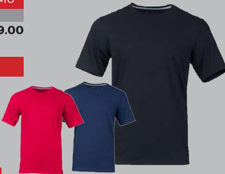
RED NAVY BLACK