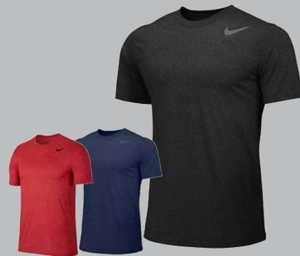
RED NAVY BLACK