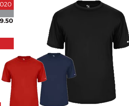
RED NAVY BLACK