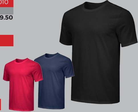
RED NAVY BLACK