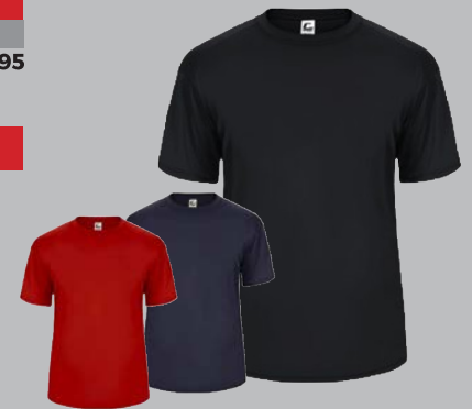
RED NAVY BLACK