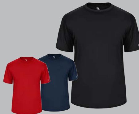
RED NAVY BLACK