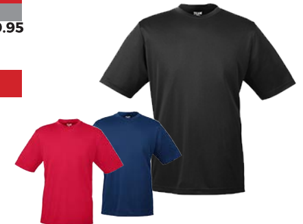
RED NAVY BLACK