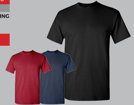
RED NAVY BLACK