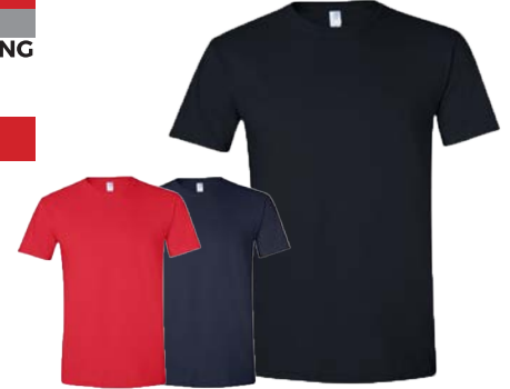
RED NAVY BLACK