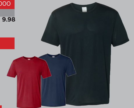
RED NAVY BLACK