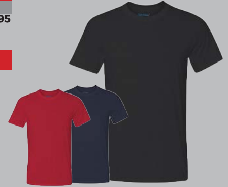
RED NAVY BLACK