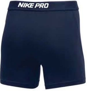
WAISTBAND ROLLOVER VIEW