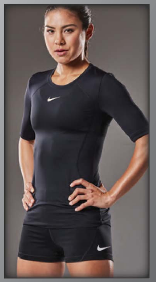
NIKE PRO HYPERCOOL SS 897828 Page 21