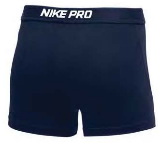
WAISTBAND ROLLOVER VIEW