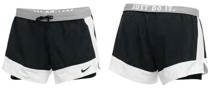
WAISTBAND ROLLED DOWN