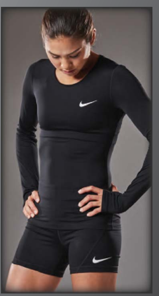
NIKE PRO ALL OVER LS 897823 Page 19