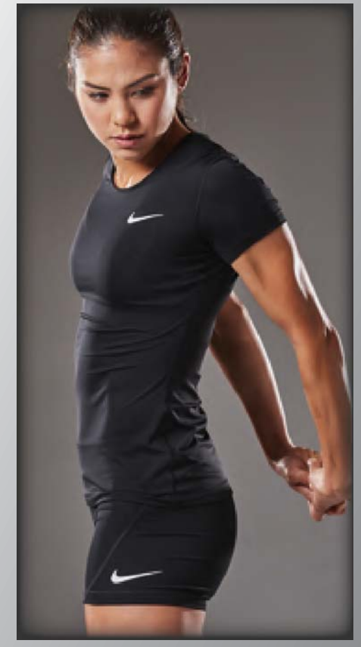
NIKE PRO ALL OVER SS 897826 Page 21