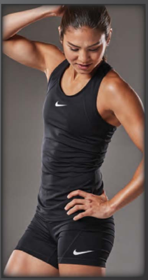
NIKE PRO ALL OVER TANK 897827 Page 23